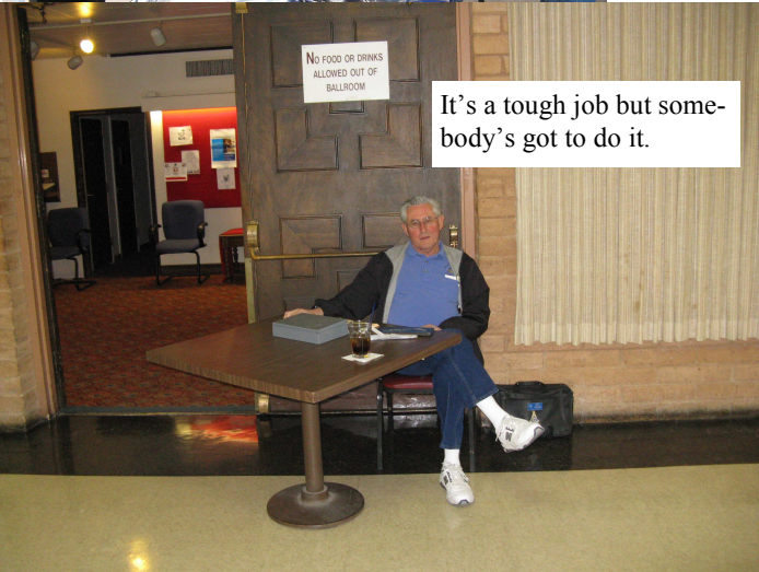
It's a tough job but somebody's got to do it.