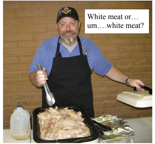
White meat or... um....white meat?