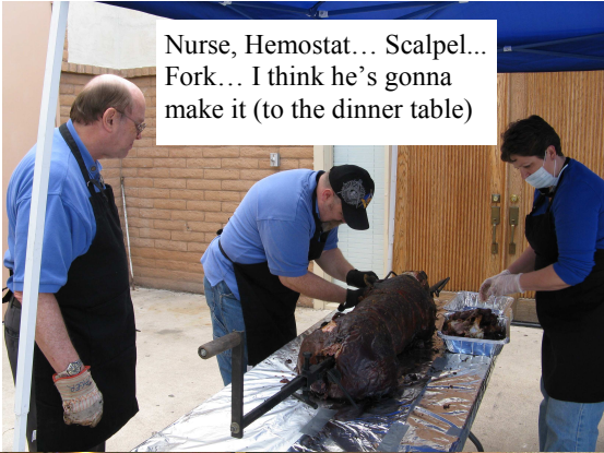
Nurse, Hemostat... Scalpel... Fork... I think he's gonna make it (to the dinner table)