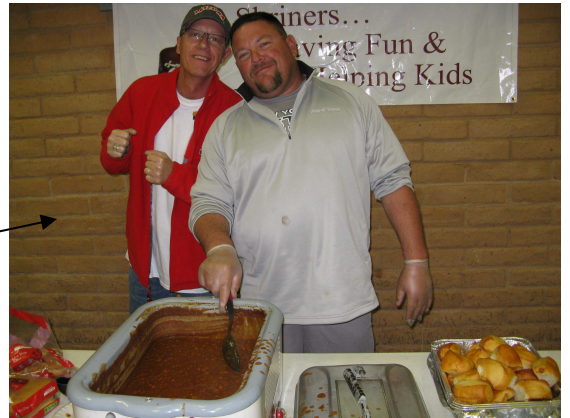
Brothers working together