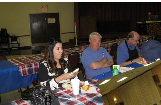
A good time was had by all who attended. Plenty of food, ... fun, and ... fellowship.